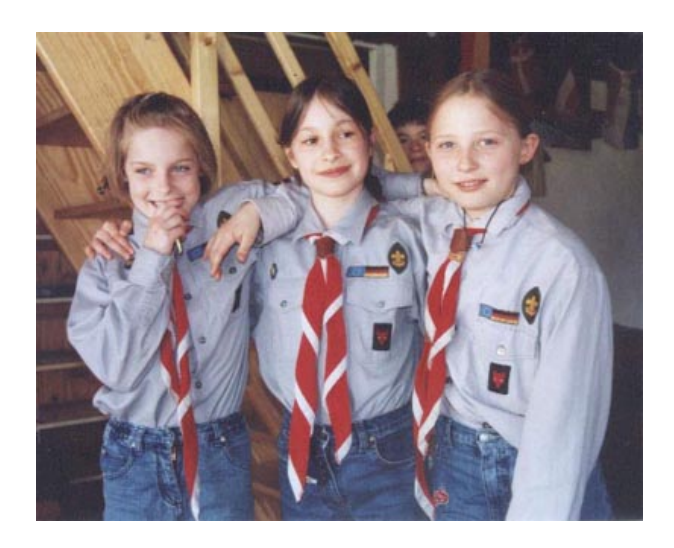
German Wolf Cubs

Pfadfinder Belt expeditions may count towards the 'Other Adventurous Projects' requirements of the Duke of Edinburgh's Award Gold Expedition, provided that a notification form is sent to the appropriate Association Headquarters at least four months before the expedition. The Pfadfinder Belt can also be used to fulfil the requirements of the St George Award expedition or parts of the other Awards, but it may not be used more than once.